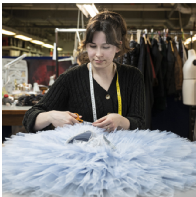
• Costume Making