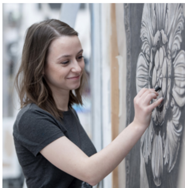
• Scenic Artist